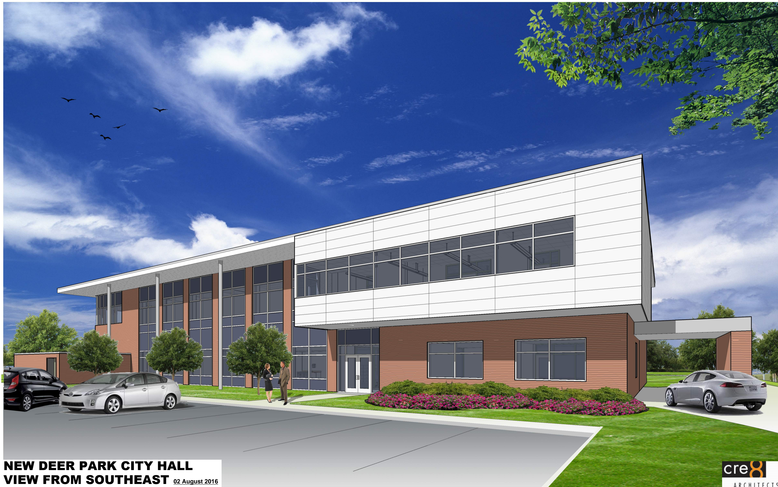
NEW DEER PARK CITY HALL VIEW FROM SOUTHEAST 02 August 2016