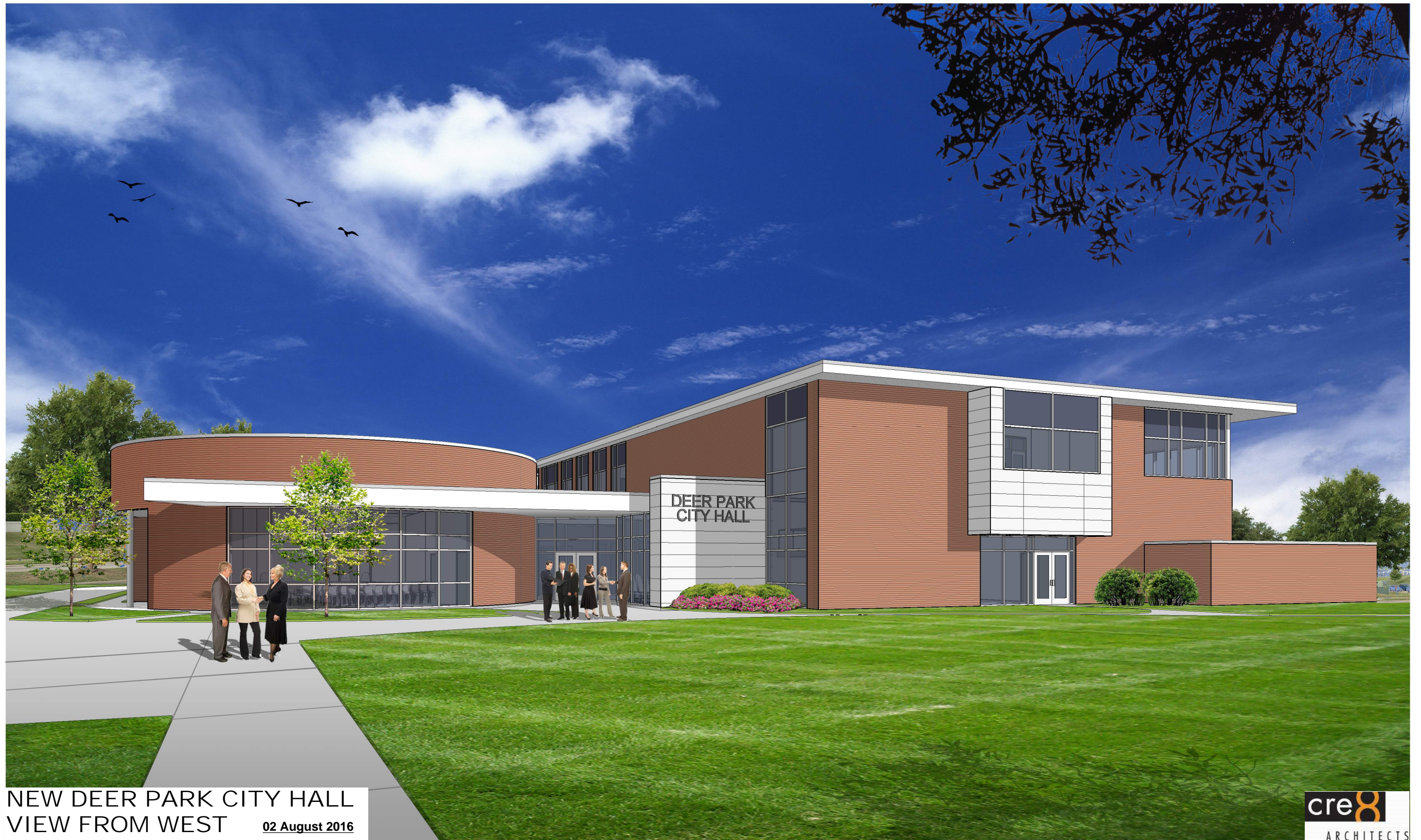
NEW DEER PARK CITY HALL VIEW FROM WEST 02 August 2016