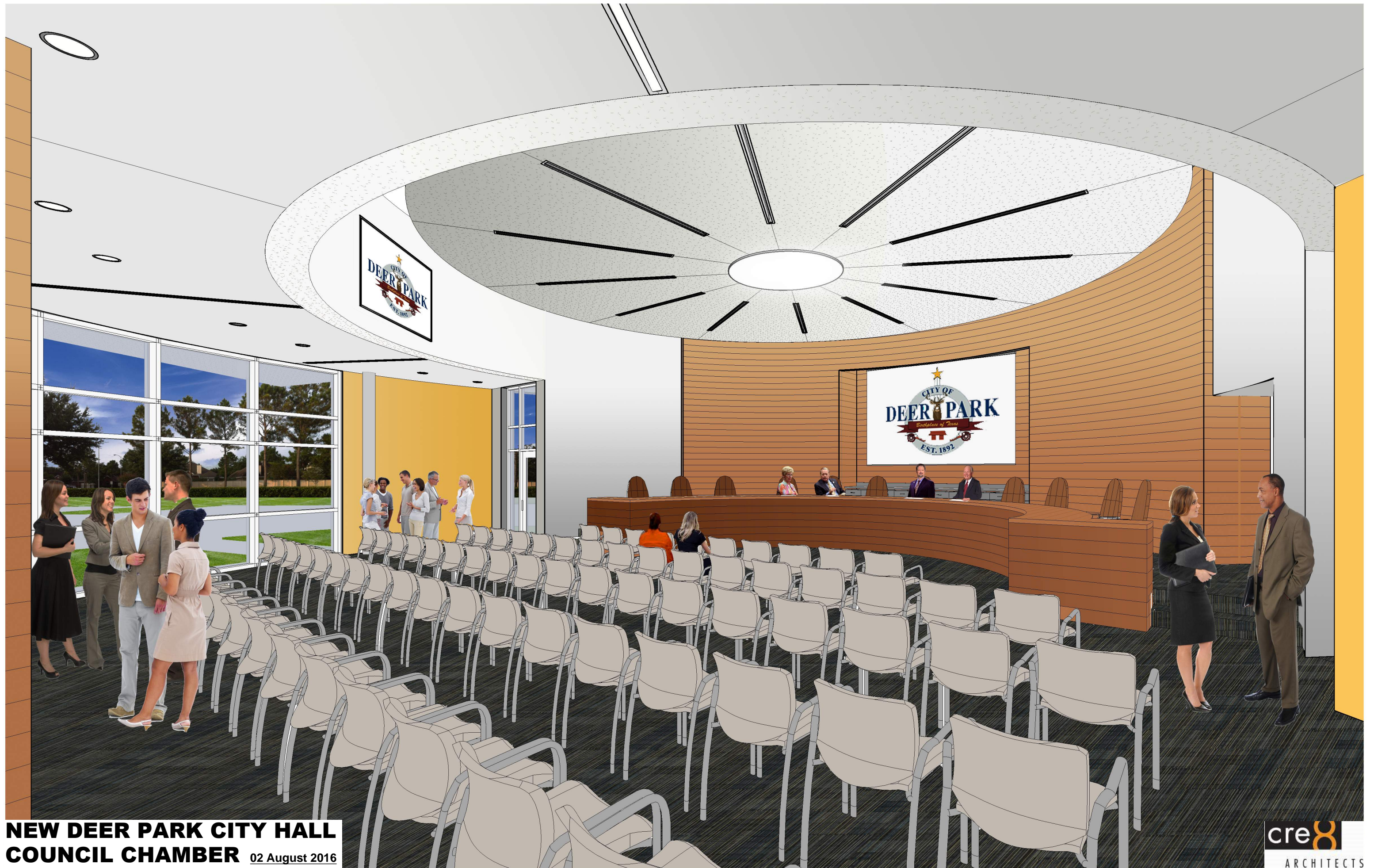
NEW DEER PARK CITY HALL COUNCIL CHAMBER 02 August 2016