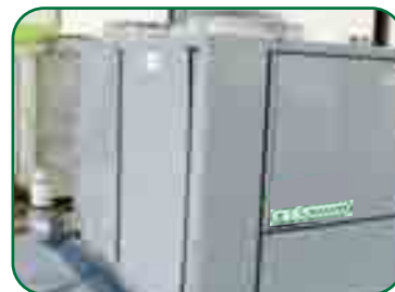
EGuard DCC Topcoat & Cabinet Casing