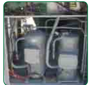
After: Treated with DCC Cabinet Casing

Spray the World. Sustainability in Cooling