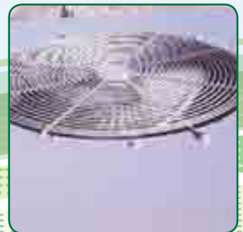
After: Treated with DCC Cabinet Casing