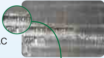
Signs of Corrosion

Your HVAC/R equipment will corrode. Because of either environmental or galvanic corrosion, it's just a matter of time. The effects of corrosion will continually degrade the performance of your HVAC systems and increase maintenance costs.