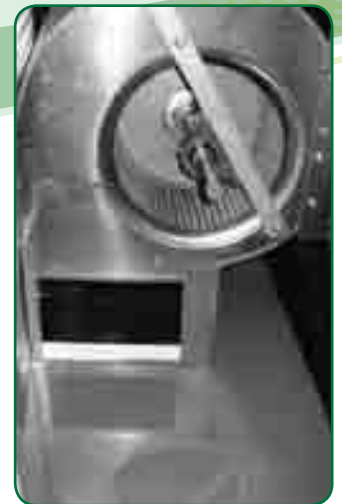
EGuard DCC SF (Flex-Cote)