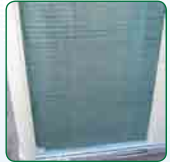
After: Coils Treated with EGuard DCC Green