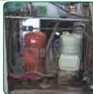
Before: Untreated Equipment