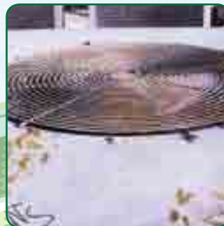
Before: Untreated Casing