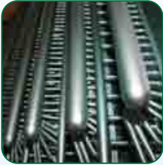
New Equipment Coils Treated with EGuard DCC Green