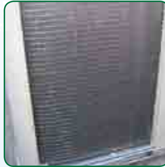
Before: Untreated Coils