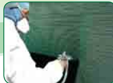
EGuard DCC Green