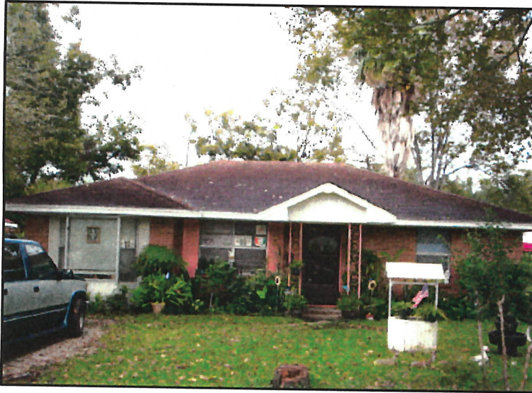
FRONT VIEW OF SUBJECT PROPERTY