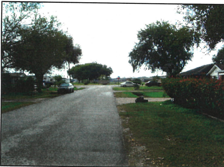
STREET SCENE OF SUBJECT PROPERTY