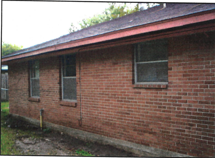
REAR VIEW OF SUBJECT PROPERTY