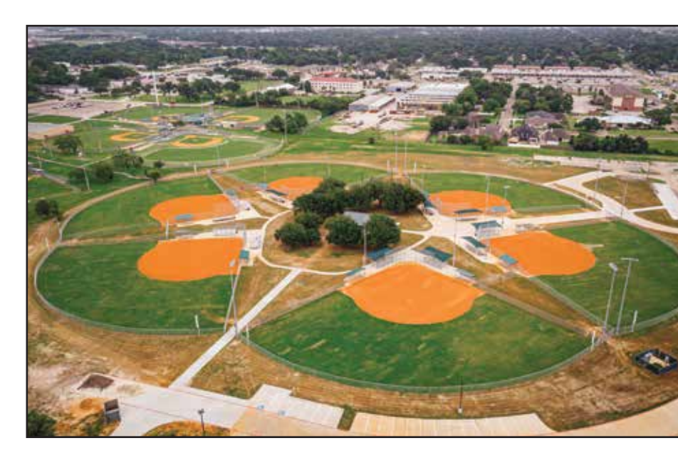
Ribbon cutting - Phase 1 June 2019 Four lighted ballfields, Two practice fields Batting cages, parking, concession stand, restroom/maintenance facilities