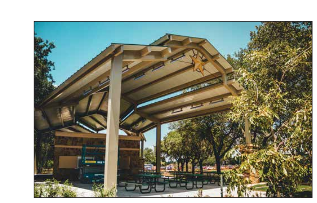
Ribbon cutting - September 2018 Features two new pavilion structures available for public use