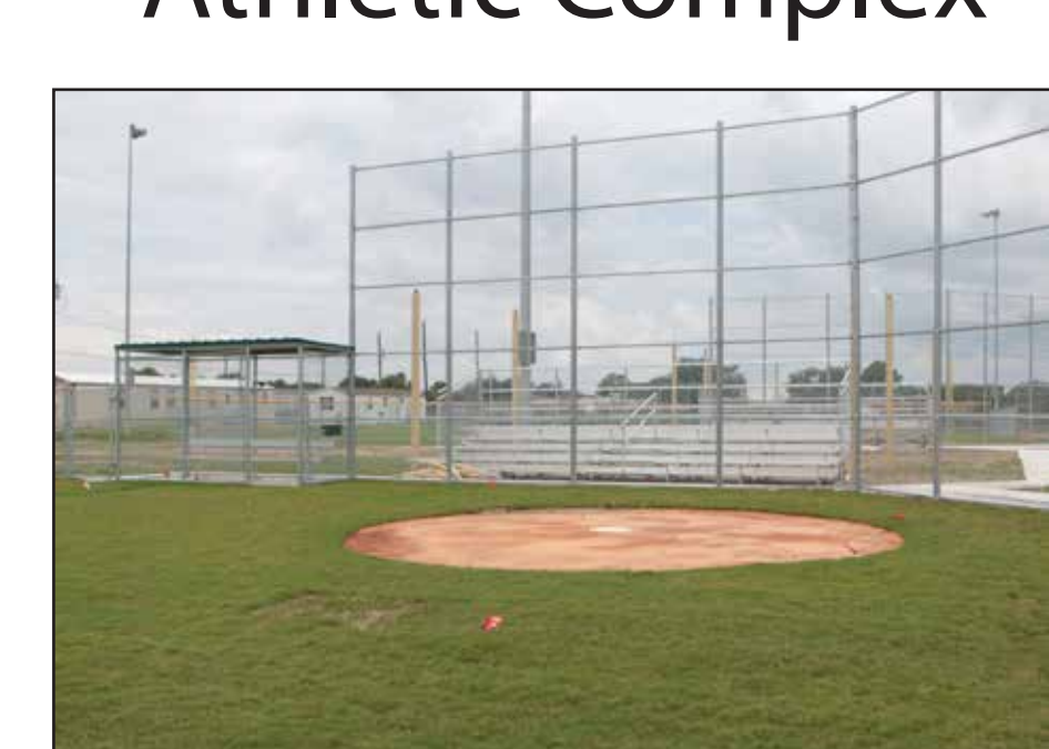
Ribbon cutting - August 2017 Features five renovated fields, eight new sets of bleachers, new concession stand