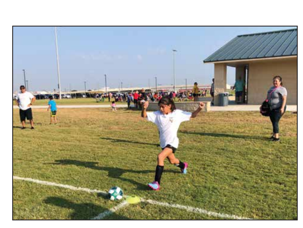
Ribbon cutting - Phase 1 August 2019 Six total fields - Four lighted fields Concession stand, meeting room and more